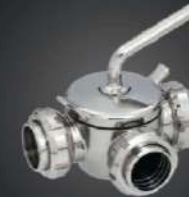
3 - WAY PLUG VALVE