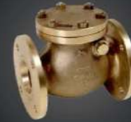
NON RETURN VALVE