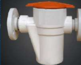
POT TYPE STRAINER