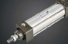
PNEUMATIC CYLINDER ACTUATOR