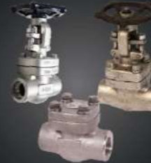
SS FORGE VALVES SCREWED