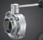
BUTTERFLY VALVE WELDABLE