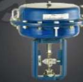
PNEUMATIC DIAPHRAGM ACTUATOR