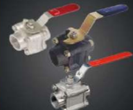
FORGE BALL VALVES