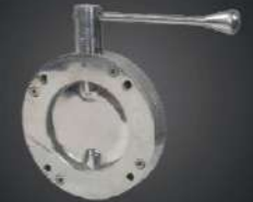
BUTTERFLY VALVE WAFER