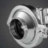
NON RETURN VALVE