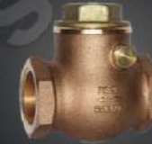
NON RETURN VALVE