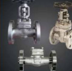
SS FORGE VALVES FLANGED