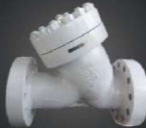
"Y" TYPE STRAINER