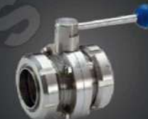
BUTTERFLY VALVE SMS UNION