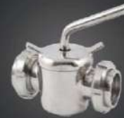
2 - WAY PLUG VALVE