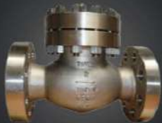
SWING CHECK VALVE