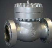
SWING CHECK VALVE