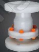
SWING CHECK VALVE