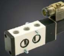
5/2 Way NAMUR